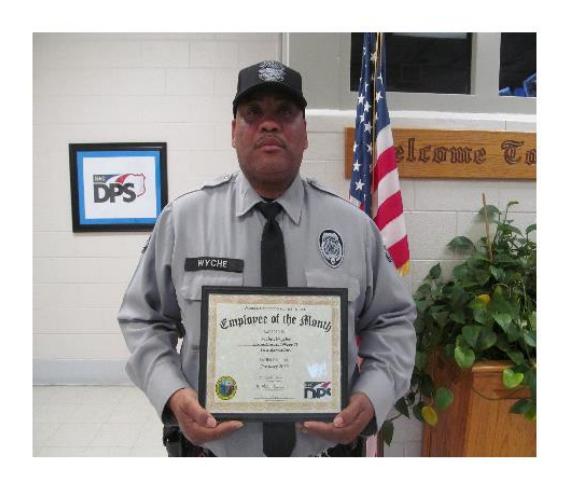
January 2019 Employee of the Month