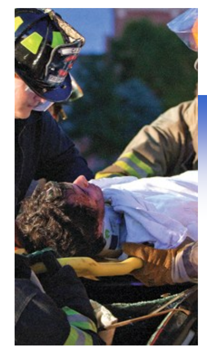
Who Is A Victim?

N.C. Department of Public Safety Victims Compensation Services